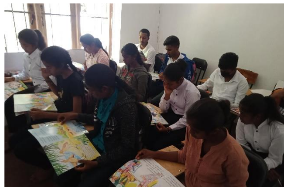
Figure 2 - Learn as a Child - Amazing Fairy Tales - Thanks to CandleAid

Professional Skills Training: Advanced level students have received specialized training in interview skills, CV (Curriculum Vitae) preparation, and the creation of professional social media profiles on platforms like Facebook and LinkedIn. These skills are essential for students as they prepare to enter the job market, giving them a competitive edge in their professional endeavors.