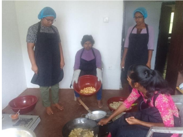
Figure 54 - The Chefs

Winrose Food Outlet is a significant initiative undertaken by Winrose Team to address the sustainability of the organization. It was launched at both Winrose's center and the Tamil National School in Haputale. The food outlet serves several key objectives that contribute to the financial health and sustainability of Winrose.