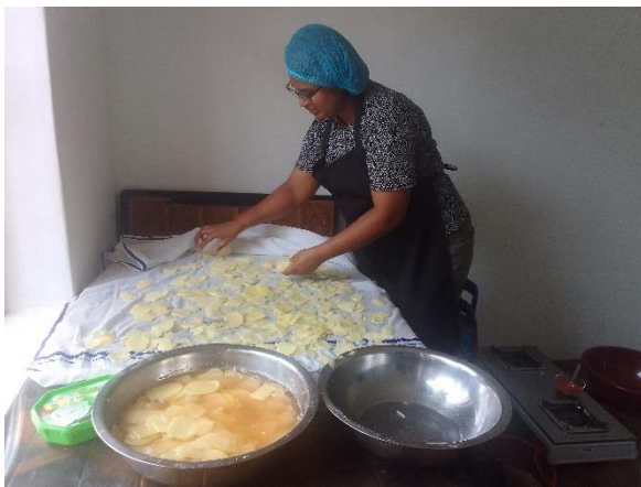
Figure 55 - Let me Try