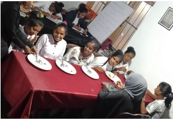
Figure 1- Find me soon in the hospitality trade.

Inclusivity: Winrose works with students at various proficiency levels, including those who are absolute beginners or at an elementary level in the English language and completely new to ICT. One of the institution's key challenges is to provide one-on-one training that caters to the specific needs of each student.